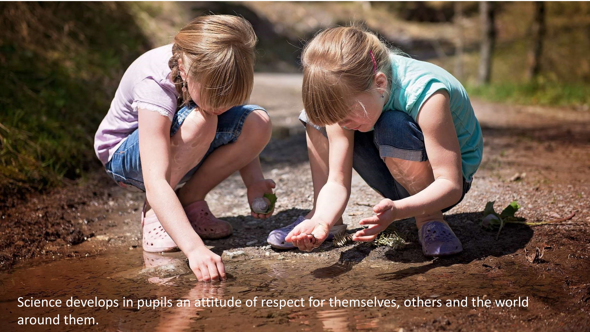
Science develops in pupils an attitude of respect for themselves, others and the world around them.