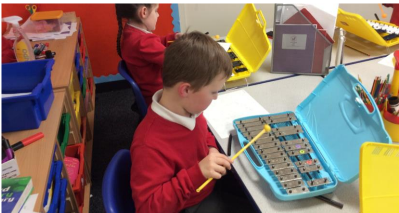
Music in Year 3/4 Year 3/4 practicing the glockenspiels.